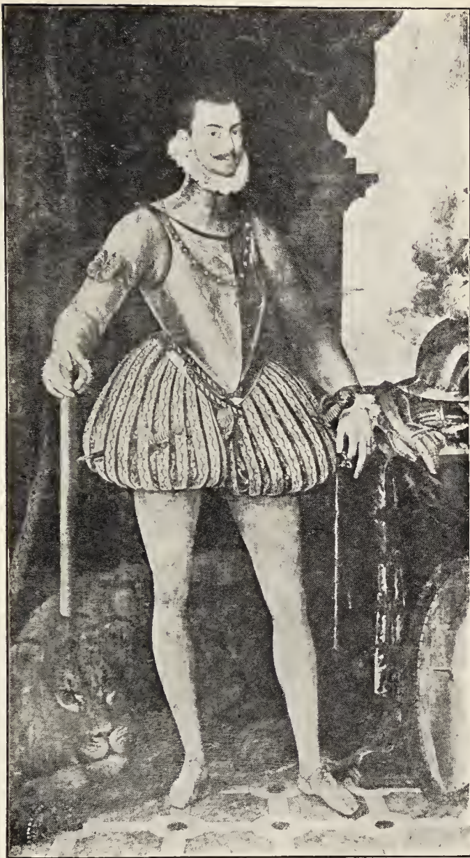
DON JUAN OF AUSTRIA.

Painting by Alonzo Sanchez Coello; Prado Museum, Madrid.